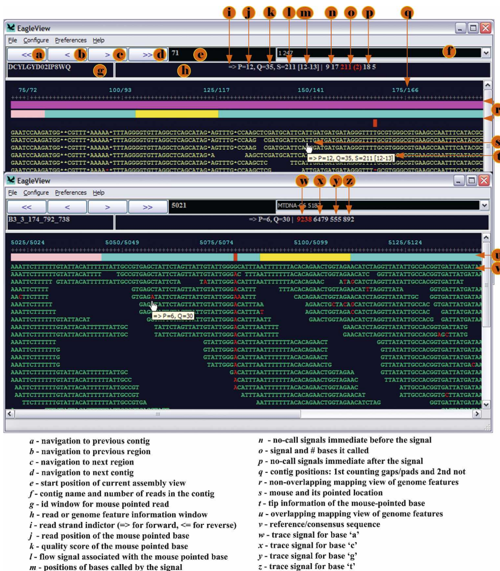
Figure 1. Illustration of EagleView features. The EagleView shown in the figure is the version for Microsoft Windows. All features except the mouse-tip window shown in the figure are also available for both Linux and Mac versions. The upper part shows a genome assembly of 454 sequence reads; the lower part displays an assembly of Illumina reads.

nome assemblies of next-generation sequence reads (see Fig. 1; Table 1). In order to utilize screen space effectively, EagleView offers a compact assembly view (i.e., reads are optimally placed in multiple lines, each having multiple reads) and displays technology-specific trace signals using a pinpoint view. It can display assemblies of mixed-type reads with the appropriate trace information. Importantly, EagleView has extensive support for displaying genome annotation tracks as well as user-defined sequence features. It allows navigation by genome location (padded or unpadded), read id, annotation feature, or any user-defined coordinate map. It also supports zooming, and customizable fonts and colors. EagleView comes with detailed documentation and is distributed as binary installation packages for the three major operating systems (Windows, Linux, and Mac). The software is available at the authors' websites.