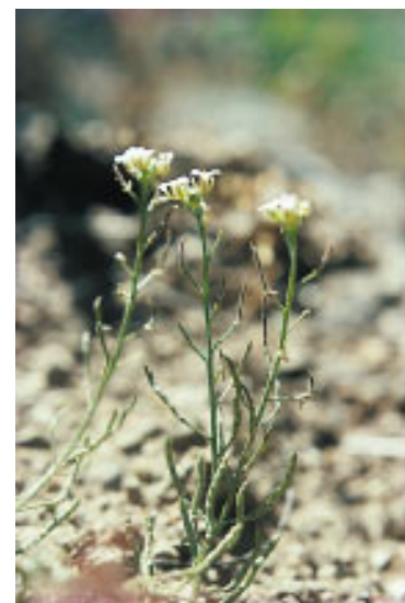
Figure 2 Wild Arabis species potentially could be used to identify gene function based on outcrossed hybrids. (A) Arabis fecunda , a rare species endemic to western Montana with some ecotypes showing drought tolerance. (B) Halimolobos perplexa , a relative of Arabidopsis that grows in the northern Rocky Mountains. It is well adapted to hot, dry environments.