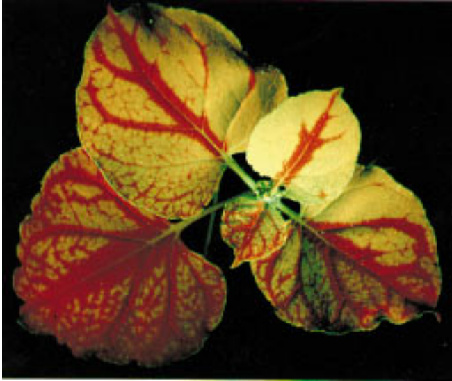
Figure 3 Gene silencing using viral vectors. 35S green fluorescence protein is silenced after infection with antisense constructs. The silencing moves apically through the plant.

and homologous transgenes can be induced by local infection with viruses or infiltration with Agrobacteria each engineered to carry a region corresponding to the target gene. The silencing of gene expression spreads throughout the plant, occurring in tissues removed from the inoculation site (Fig. 3). The mechanism by which this occurs is as yet unknown (Palauqui et al. 1997; Voinnet and Baulcombe 1997). However, this method will be useful for studying the effects of disrupting expression of multigene families and genes essential for plant development.