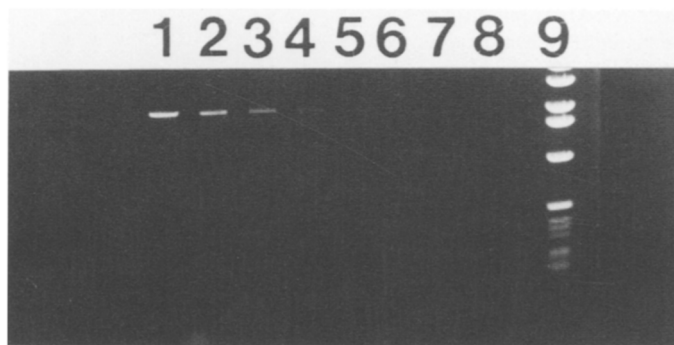
FIGURE 1 Amplification of a 1.84-kb DNA fragment spanning exons 5–9 of human of genomic p53. Serial dilutions of template DNA extracted from cell line COLO 320 DM were amplified as described in the text. Five microliters of the PCR assays were loaded onto a 1% agarose gel, stained with ethidium bromide, and photographed under UV light. (Lane 1) 8 ng of template; (lane 2) 4 ng of template; (lane 3) 2 ng of template; (lane 4) 1 ng of template; (lane 5) 0.5 ng of template; (lane 6) 0.25 ng of template; (lane 7) 0.125 ng of template; (lane 8) 62.5 pg of template; (lane 9) size standards (1-kb ladder, GIBCO BRL).