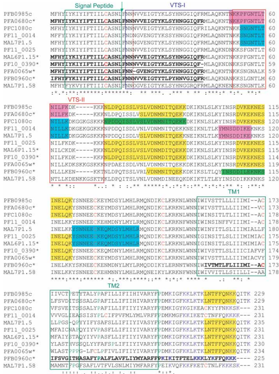
Figure 2 Multiple sequence alignments. The sequences of the Maurer's cleft 2-transmembrane domain proteins were aligned using CLUSTAL W (1.82) (Thompson et al. 1994). (*) Conserved residues. Bold, underlined sequences indicate regions of the proteins that were extended from the originally published gene models (Gardner et al. 2002), on the basis of the complete chromosome sequences that were obtained from PlasmoDB (Bahl et al. 2002). The red-dotted vertical line indicates the boundary between exon 1 and exon 2. The regions covered by peptides identified during the MS/MS analyses are highlighted. The green, magenta, cyan, and yellow color coding stands for peptides unique to a protein, and peptides common to two, three, and more than three proteins, respectively. The green boxes indicate the position of signal peptide and transmembrane domains as predicted by SignalP (Nielsen et al. 1997) and TMHMM (Krogh et al. 2001), respectively. The arrow points at the potential processing site. The red and blue boxes define potential bipartite vacuolar translocation signals (VTSs) as described by Lopez-Estrano et al. (2003).

vergent, as it did not have a signal peptide and was much shorter, missing the C-terminal transmembrane domains. The complete sequences of the chromosomes bearing these genes were downloaded from PlasmoDB (Bahl et al. 2002) and investigated using the Artemis genome sequence viewer (Rutherford et al. 2000). We were able to extend the sequences of these five genes beyond the boundaries preliminarily predicted by the gene-modeling algorithm (Fig. 2, underlined sequences). In all five cases, a 5' ORF