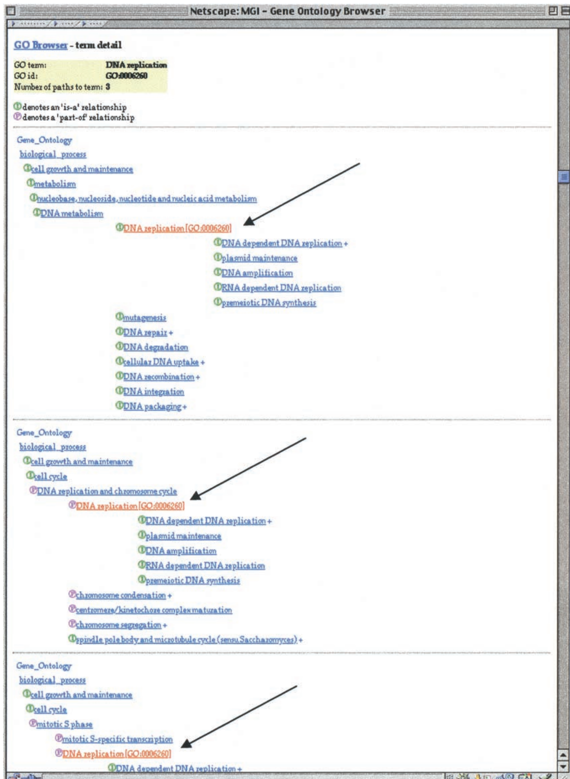
Figure 1 Multiple pathways. This figure illustrates the different pathways that represent the biological process of DNA replication. Viewed in the GO Browser, the relationships between the terms, the GO ID for DNA replication, and information about the number of pathways incorporating this biological process are displayed.