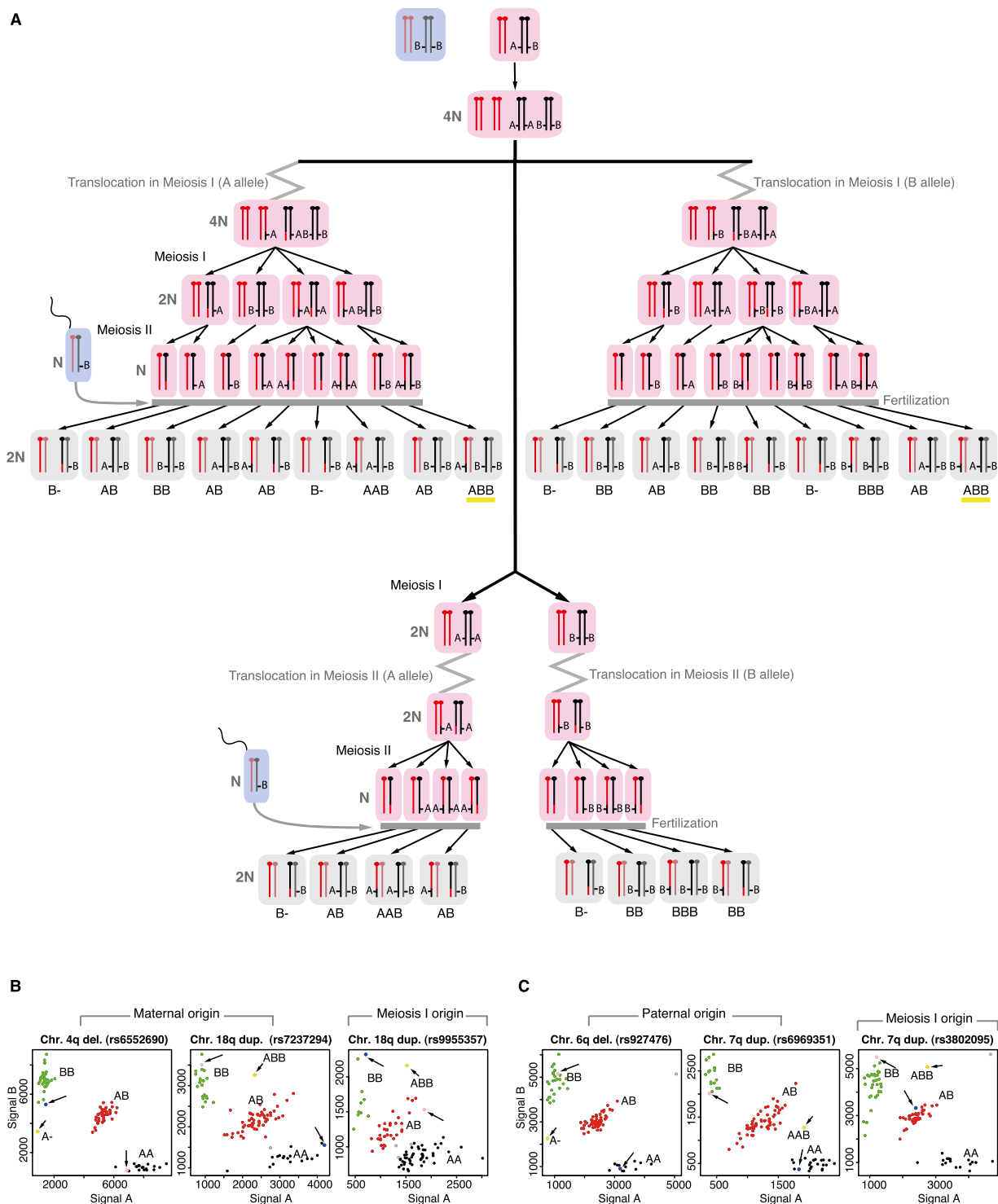
Figure 2. Resolving meiotic origin of de novo unbalanced translocations. (A) A schematic illustration of different segregants following a meiotic I or II de novo unbalanced translocation event. (Rose rectangles) Maternal gametes; (blue rectangles) paternal gametes; (gray rectangles) the zygote. In this figure, the translocation event occurs in the maternal gamete. Within those rectangles, the black and red colors represent maternal chromosomes, and dark gray and dark pink colors represent paternal chromosomes. To discriminate a meiosis I from a meiosis II event, maternal heterozygous SNPs and paternal homozygous SNPs are considered. The presence of ABB SNP-calls (underlined with yellow color) present in the duplicated region of the translocated chromosomes can only be the consequence of a premeiotic or a meiotic I event. (B) The SNP plots of parental homozygous SNPs demonstrate that both the deletion and duplication (left two panels) are of maternal origin, while the analysis of the maternal heterozygous and paternal homozygous SNPs demonstrates a premeiotic or meiosis I origin (right panel). (C) The SNP plots of parental homozygous SNPs demonstrate that both the deletion and duplication (left two panels) are of paternal origin, while the analysis of the paternal heterozygous and maternal homozygous SNPs demonstrates the premeiotic or meiosis I origin (right panel). Green, red, black, and gray dots represent controls with a BB, AB, AA, and NoCall genotype, respectively. The pink and blue dots represent the genotypes of the mother and father and the longer arrows point to them. The yellow dots indicate the genotype call of the index patient and are indicated by the shorter arrow. The SNP plots of parental homozygous SNPs demonstrate that the duplication (left two panels) is of maternal origin, while the deletion (right panel) is of paternal origin.