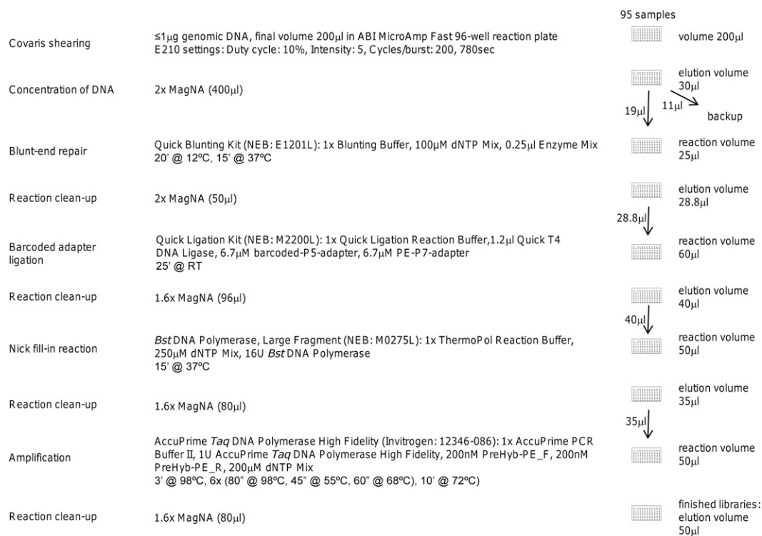
Figure 1. Experimental workflow of the library preparation protocol for 95 samples for pooled hybrid capture.

2010; Borgstrom et al. 2011). Another change is to replace a commonly used commercial kit (AMPure XP kit) for SPRI-cleanup steps with a homemade mix. An important feature of our libraries compared with almost all other Illumina library preparation methods (Cummings et al. 2010; Mamanova et al. 2010; Meyer and Kircher 2010; Teer et al. 2010) is that we add a 6-bp “internal” barcoded adapter to each fragment (Craig et al. 2008). These adapters are ligated directly to the DNA fragments, leading to “truncated” libraries with 34- and 33-bp overhanging adapters at the end of each DNA fragment. Adapters at this stage in our library preparation are sufficiently short that they interfere with each other minimally during hybrid capture, compared with what we have found when long adapters are used (64 and 61 bp on either side, including the 6-bp internal barcode). The truncated adapter sites are then extended to full length after hybrid capture allowing the libraries to be sequenced (Fig. 2A). To assess how this strategy works in different-sized pools (between 14 and 95), we applied it to 2.2 Mb of the genome of interest for prostate cancer, where it reduces the capture reagent that is required by two orders of magnitude while still producing highly useful data. Sequencing these libraries shows that we can perform pooled target capture on at least 95 barcoded samples simultaneously without substantial reduction in capture efficiency.